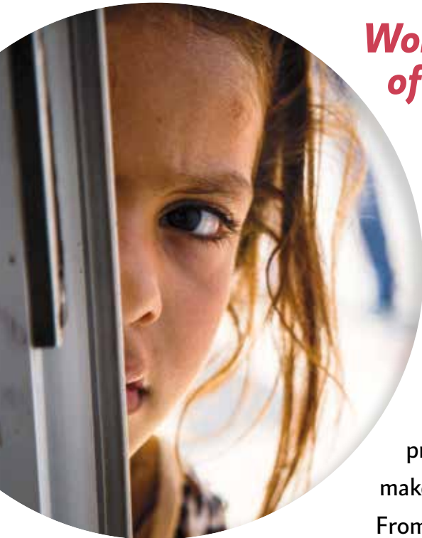
Actual victim not shown.