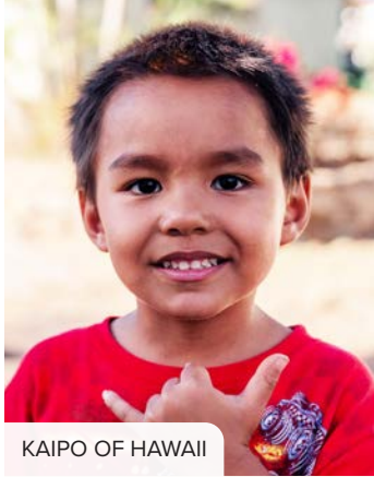
KAIIPO OF HAWAII